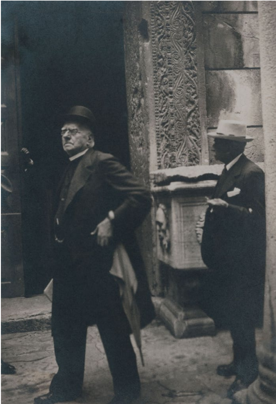
DON FRANE BULIĆ AND SIR ARTHUR EVANS IN FRONT OF THE SO-CALLED TEMPLE OF JUPITER WITHIN DIOCLETAIN'S PALACE (NOW THE BAPTISTRY OF THE CATHEDRAL IN SPLIT). JUNE 1932.