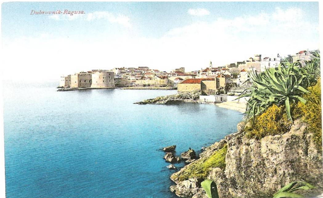
VIEW FROM CASA SAN LAZZARO. POSTCARD.