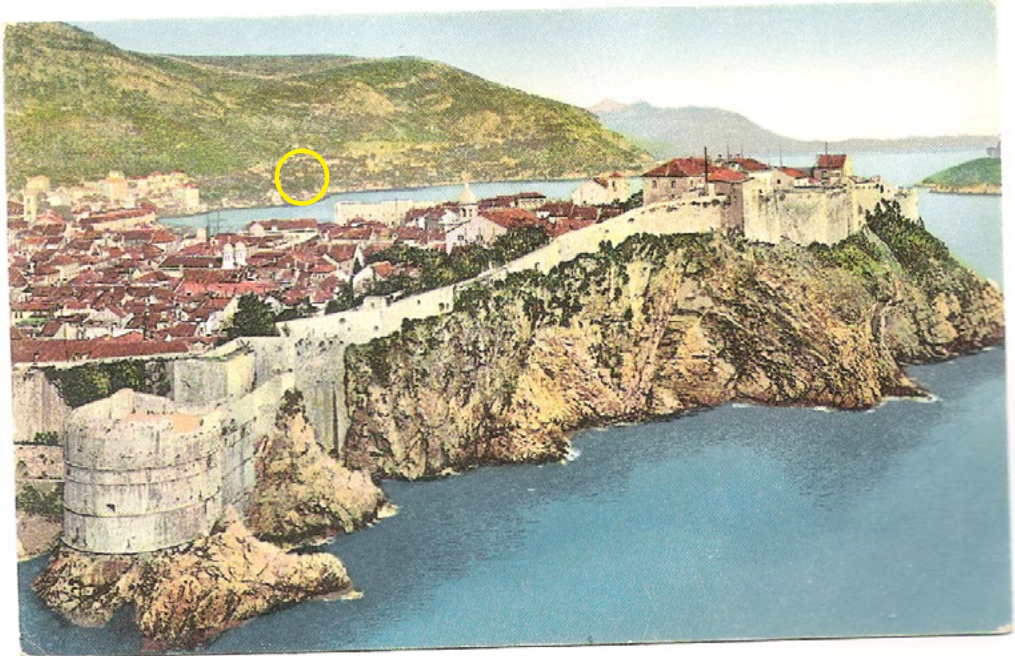
DUBROVNIK, LATE 19TH CENTURY POSTCARD. YELLOW CIRCLE: CASA SAN LAZZARO