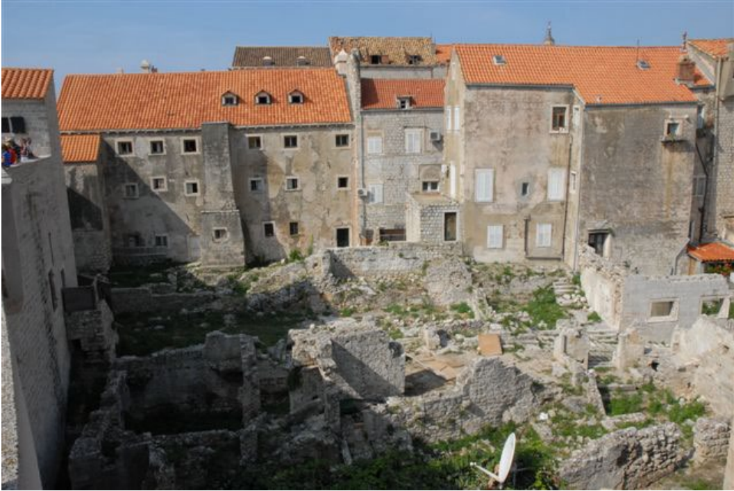
THE FORMER AUSTRIAN JAIL (LEFT) WAS TO BE THE HOUSE OF THE ARCHAEOLOGICAL MUSEUM WITH THE EXCAVATED REMAINS OF THE PRE EARTHQUAKE IN 1667.