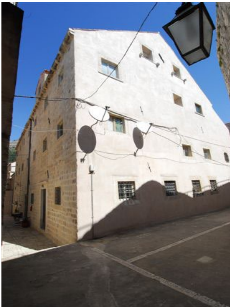
THE FORMER AUSTRIAN JAIL, RENOVED AFTER THE EARTHQUAKE IN 1979