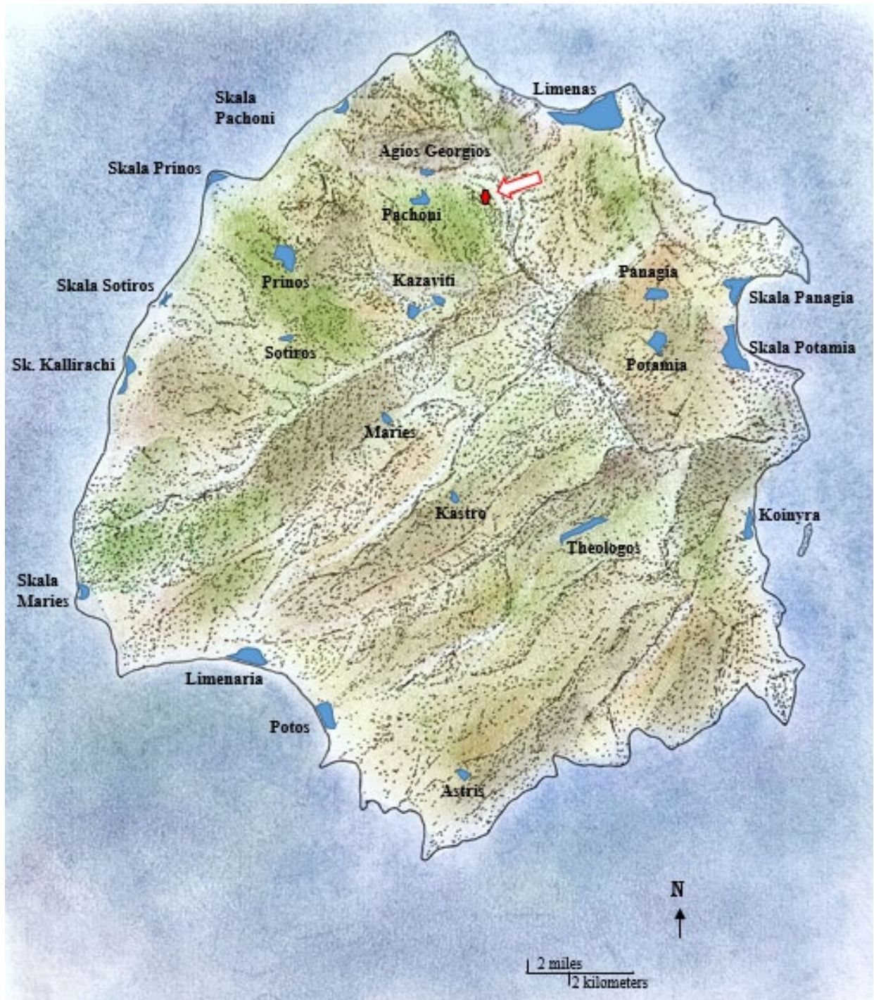
Figure 2. Map of Thasos island, with the location of its capital city Limenas, its villages and settlements, and the location of Paliokastro (see arrow) in the region of Rachoni village, rendering by Argie Agelarakis.

did back then, with Parian Tellis and Kleobeia. 1 Moreover, in the midst of the wealth of this enchanting beauty, you may at first unwittingly overlook the spread of vestiges of diachronic human dynamics