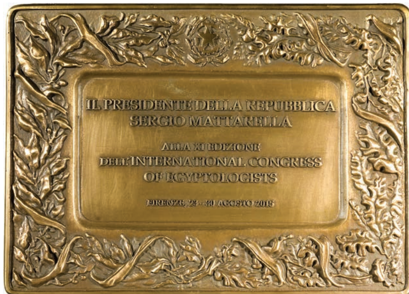
Recognition award of the President of the Italian Republic, Sergio Mattarella, for the 11th International Congress of Egyptologists.