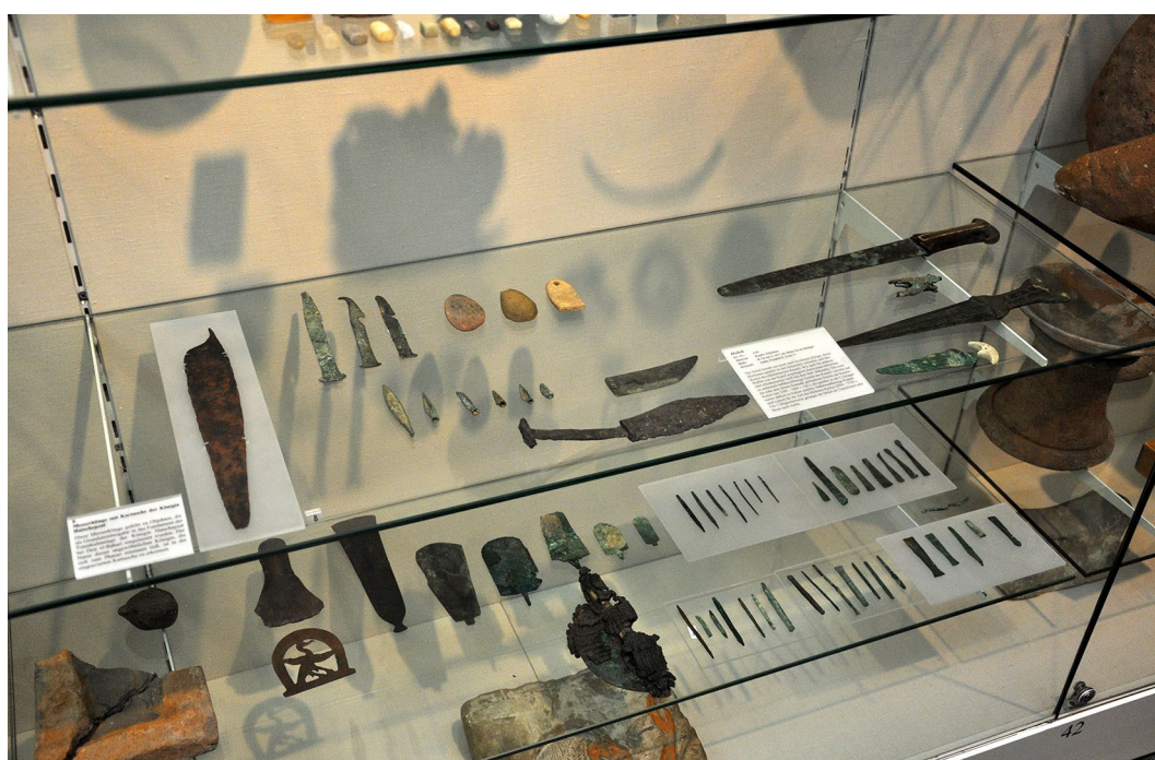
Figure 1: Metal artefacts in the Egyptian Museum of the University of Leipzig, photo by Jiří Kmošek © Faculty of Arts, Charles University, Czech Institute of Egyptology.

The Ägyptisches Museum – Georg Steindorff – der Universität Leipzig (usually abbreviated ÄMUL; located in the Free State of Saxony in Germany) holds an important collection of ancient Egyptian and Nubian artefacts, one of the largest in Germany and Europe in general, counting c. 9,000 inventory numbers (Figure 1). It is the largest university collection of the ancient Egyptian artefacts in Europe. It was founded as early as the 19th century, but its collection was enriched largely during the curatorship of Georg Steindorff (1861–1951), one of the most important German Egyptologists of late 19th and early 20th centuries. Our project, generously approved by one of Steindorff’s successors, Dr Dietrich Raue, could incorporate a broad selection of 86 artefacts (i.e. inventory numbers) representing the development of ancient Egyptian metallurgy over more than one and